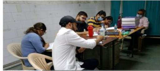
Ghaziabad Uttar Pradesh India 2021-03-30(Tue) 10:24(am)