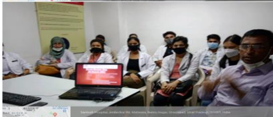
Ghaziabad Uttar Pradesh India 2021-03-30(Tue) 10:14(am)