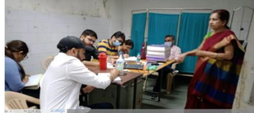
Ghaziabad Uttar Pradesh India