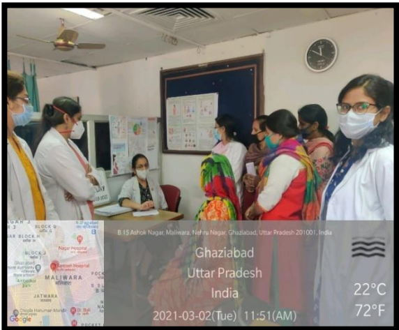
Signature of HOD