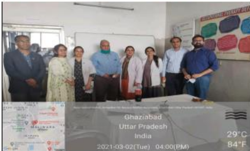
Signature of HOD