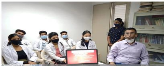
Ghaziabad Uttar Pradesh India 2021-03-30(Tue) 10:14(am)