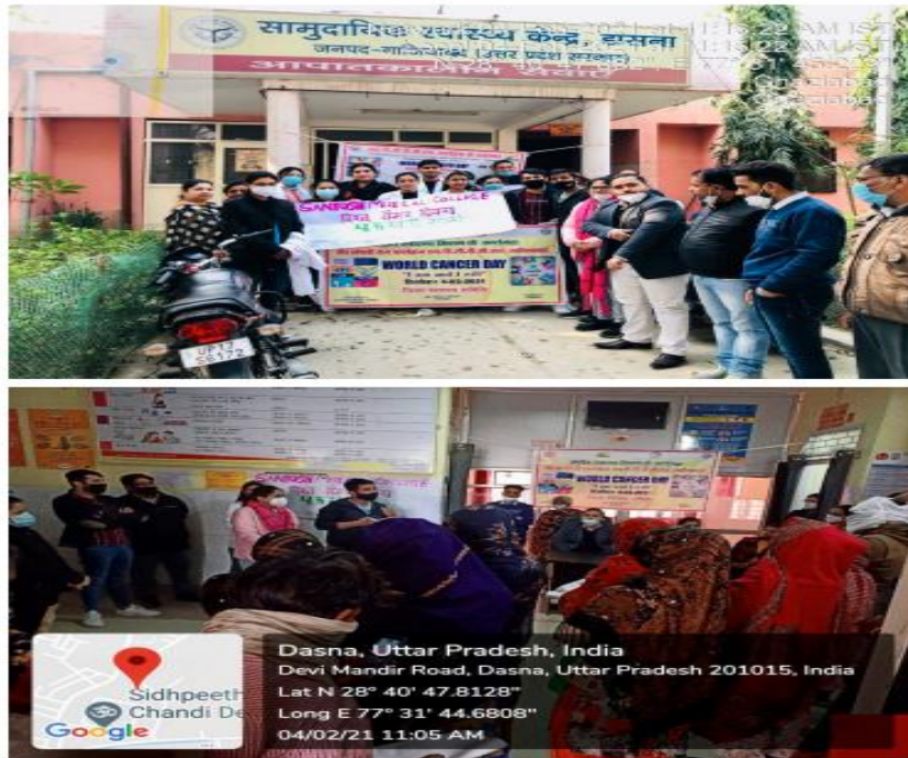
Signature of HOD