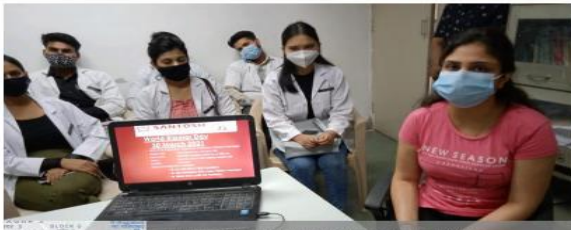
Ghaziabad Uttar Pradesh India 2021-03-30(Tue) 10:15(am)