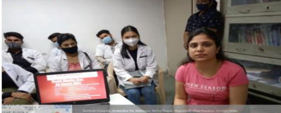
Ghaziabad Uttar Pradesh India 2021-03-30(Tue) 10:15(am)